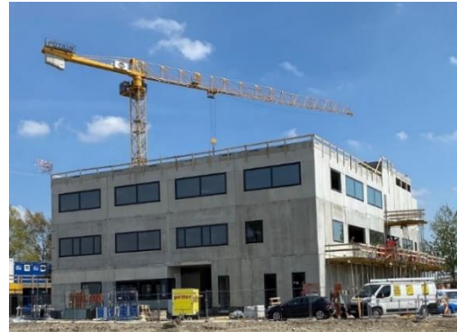
Current Status of Construction Works (May 2021)

Biomay AG is a biopharmaceutical contract development and manufacturing organization (CDMO) with international reach. In particular, Biomay is recognized as supplier for plasmid DNA (pDNA), recombinant proteins and messenger RNA (mRNA). Biomay's clients include start-ups, midsize biotech companies and multinational enterprises, predominantly from Europe and the US. Beside manufacturing of active ingredients and drug products according to GMP standards, the company offers process and assay development as well as manufacturing of microbial cell banks.