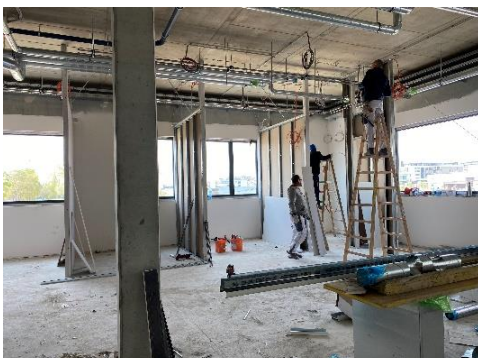
Manufacturing- and Office Spaces under Construction (May 2021)