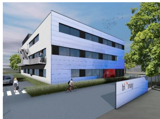
Rendering of Biomay's new Headquarters and GMP Manufacturing Facility